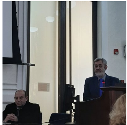
HUB - Support Center for International R&D Projects for the Oltenia region, Craiova, February 14, 2023