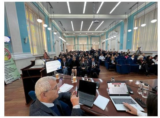
Regional Innovation Forum, University of Craiova, February 27, 2023.